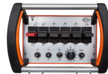
Version with linear levers.