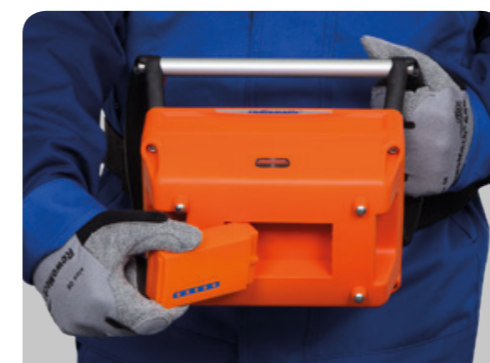
High-performing Li-ion exchange batteries, optional with capacity gauge.