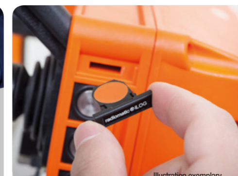
radiomatic® iLOG for the quick activation of a spare transmitter.