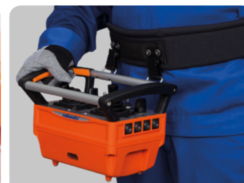
Carrying with the hip belt.